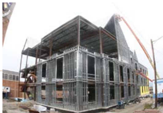
The building began to take shape with structural steel erection.

Most people also like it. In a survey about the Fresh Food Company conducted on opening day, 77 percent of diners said the food quality was “excellent, amazing, awesome, good.”