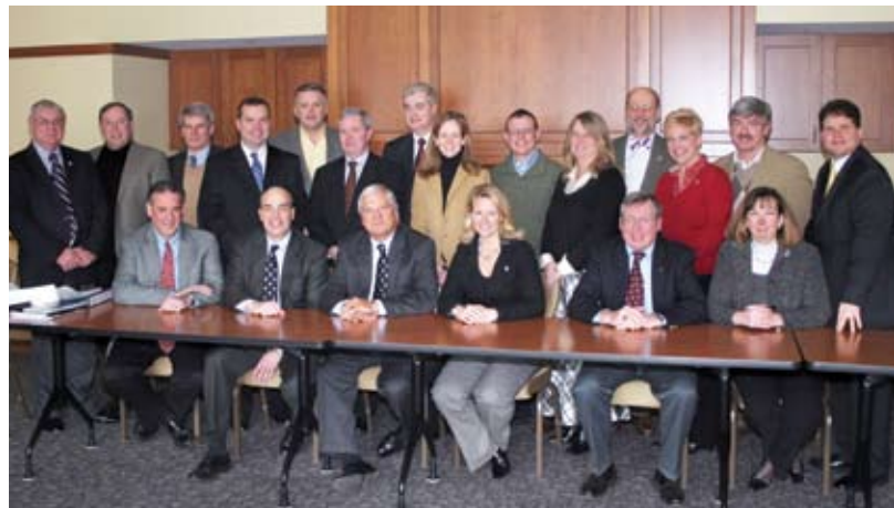
The Alumni Board of Governors met on Jan. 26, 2008.