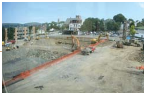
Work on the foundation continued through the summer and fall of 2006.