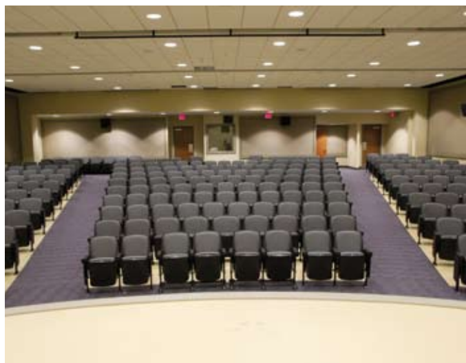
A 260-seat theater on the fourth floor boasts high-definition video, surround sound and comfortable, oversized theater seating.

There are additional a la carte dining options on first floor, including Quiznos, Starbucks, Chick-fil-A and Zoca. Along what Dr. Carilli refers to as “Main Street”