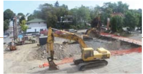
Excavation began in the summer of 2006.

a place where students will want to come and get to know one another. It's not just a cafeteria anymore."