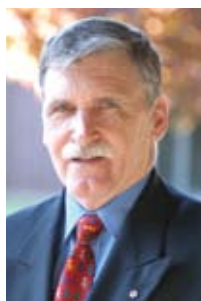
Lieutenant-General Roméo A. Dallaire

A Canadian Lieutenant-General whose firsthand experience with Rwandan genocide inspired him to write a best-selling book that is the basis for an award-winning documentary and film spoke at the University on March 26 in the Houlihan-McLean Center.